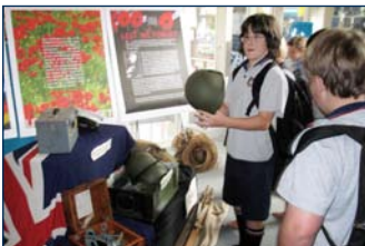
ABOVE: ANZAC display at Belmont Intermediate.

These presentations have been a valuable way of us spreading the word in respect of the Navy Museum and our redevelopment plans. The presentations have been really well received and the feedback from the groups has been extremely positive and supportive. We are booked out for the next two months.