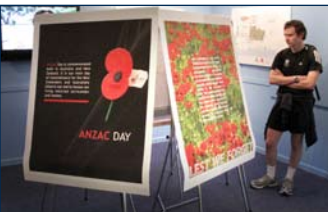
ABOVE: Temporary ANZAC display in the Navy Museum.