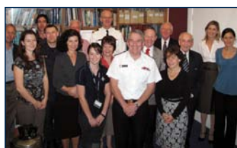
ABOVE: The Navy Museum Staff presented, Rear Admiral Ledson a personalised photo album. Staff grouped for a photo at the farewell morning tea.