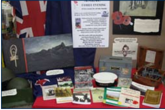
ABOVE: A collaborative Navy Museum and Devonport Library ANZAC display.